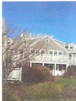
nantucket: the nantucket hotel