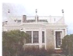
martha's vineyard: winnetuxit oceanside resort