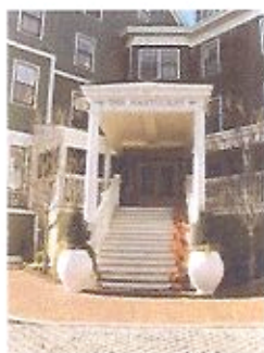
cape cod: the chatham bars inn