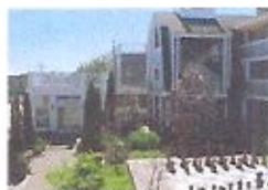
nantucket: strolling the island's streets - shops